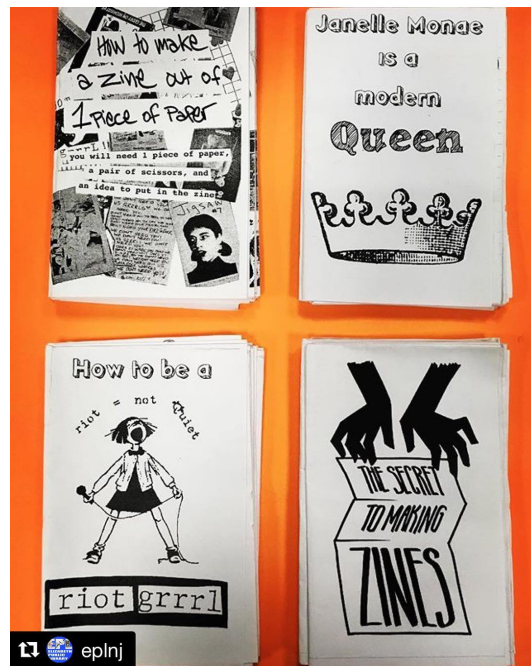
Left: From a series of images of child circus performers and their snakes, naturally! Right: Some zines at an NJ Makers' Day event at Elizabeth Public Library