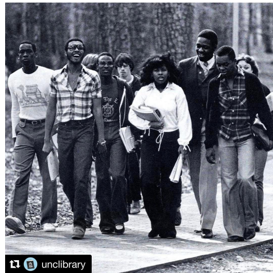
Left: Meet The Staff (and their eponymous books!) at Eagle Rock HS Library Right: An instant classic for #styleinthestacks from the University of North Carolina's 1979 yearbook